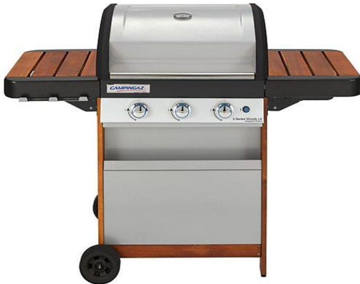
3 SERIES WOODY LX