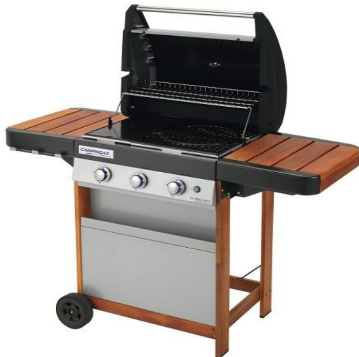
CLASS 3 WLX (ELECTRONIC) CLASS 3 WLX FR (PIEZO)